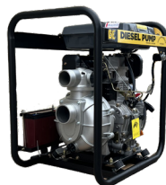
TRANSFER PUMPS WATER MOVERS