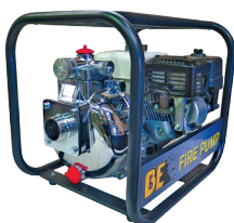
HIGH PRESSURE FIRE PUMPS